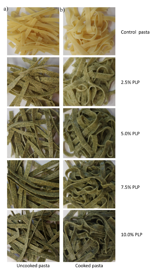
Fig. 1. Control pasta and pasta fortified with various levels of parsley leaf powder (PLP): a) – uncooked pasta, b) – cooked pasta at OCT.

uncooked pasta. The reduction in the degree of greenness and yellowness after the cooking of the fortified pasta samples may be due to thermal degradation and/or the leaching of pigments (Sant'Anna et al. , 2014; Mercier et al. , 2016).